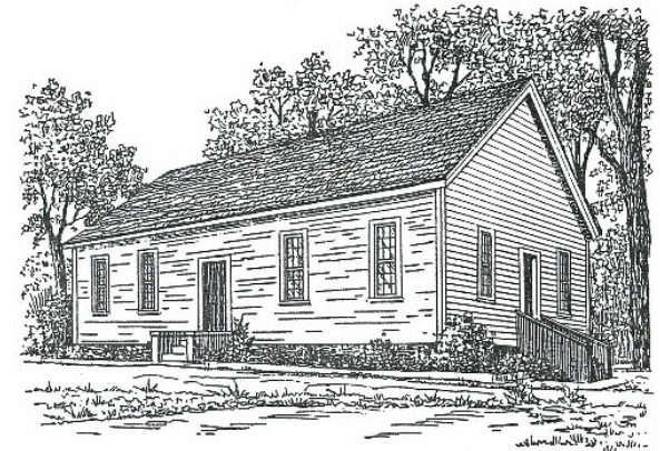
Poplar Springs Baptist Church ca. 1854